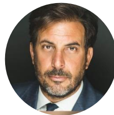
Federico CORNELLI Commissioner of CONSOB