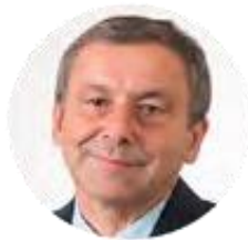
Francesco Profumo President of Quadrivio Group and of IsyBank