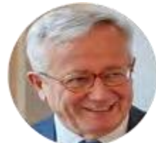
Giulio Tremonti President of Aspen