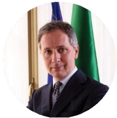
Saverio VALENTINO Component of Italian Competition Authority