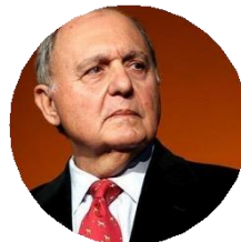
Paolo Savona President of CONSOB