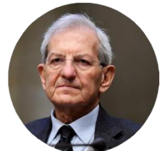
Luciano Violante President of Fondazione Leonardo – Civiltà delle Macchine