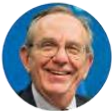
Pietro Carlo Padoan Presidente of UniCredit