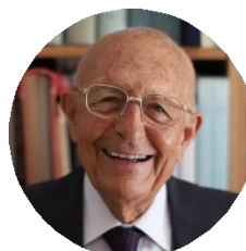
Sabino Cassese Constitutionalist