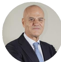
Claudio Descalzi CEO of Eni