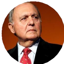
Paolo Savona Presidente of CONSOB