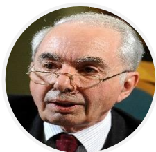
Giuliano Amato President Emeritus of the Constitutional Court

The High-Level Committee will carry out all the tasks relating to the strategic-didactic direction and orientation function through the annual drafting of some guidelines for the higher education path.