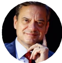
Lorenzo Bini Smaghi President of Société Générale