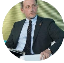
Massimo Giannini Writer and journalist