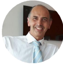
Federico Eichberg Chief Cabinet of Ministry of Enterprises and Made in Italy