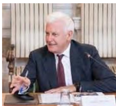
A. Profumo, CEO of Leonardo