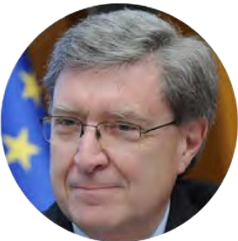
ENRICO GIOVANNINI PRESIDENT