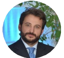
Serafino SORRENTI Chief Information Officer of Presidency of the Council of Ministers