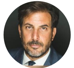
Federico CORNELLI Commissioner of CONSOB