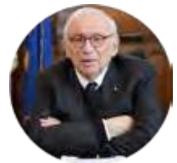
Patrizio BIANCHI UNESCO Chair in "Education, Growth and Equality"