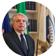
Renato Brunetta President of CNEL