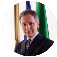
Saverio VALENTINO Component of Italian Competition Authority