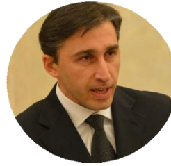
Renato LOIERO Counselor of the President of the Council of Ministers