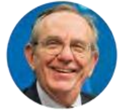
Pietro Carlo Padoan Presidente of UniCredit