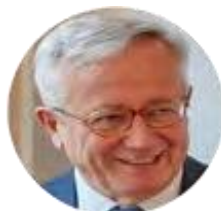
Giulio Tremonti President of Aspen