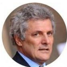
Alain Elkann Writer and journalist