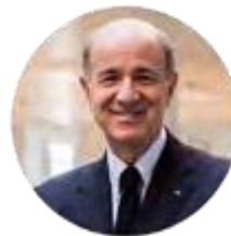
Corrado Passera Founder and CEO of Illimity