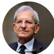
Luciano Violante President of Fondazione Leonardo – Civiltà delle Macchine