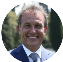
Vito Cozzoli CEO of Autostrade dello Stato