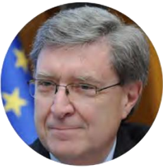
ENRICO GIOVANNINI PRESIDENT