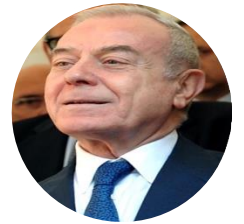
Gianni Letta President of Civita