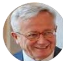
Giulio Tremonti President of Aspen