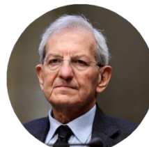
Luciano Violante President of Fondazione Leonardo – Civiltà delle Macchine