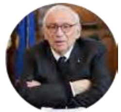
Patrizio BIANCHI UNESCO Chair in "Education, Growth and Equality"