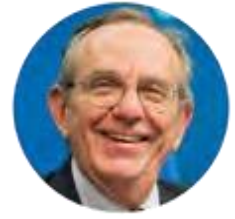
Pietro Carlo Padoan Presidente of UniCredit