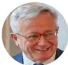
Giulio Tremonti President of Aspen