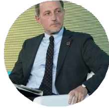
Massimo Giannini Writer and journalist