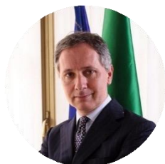
Saverio VALENTINO Component of Italian Competition Authority