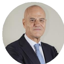
Claudio Descalzi CEO of Eni