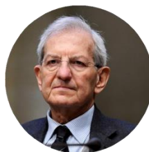
Luciano Violante President of Fondazione Leonardo – Civiltà delle Macchine