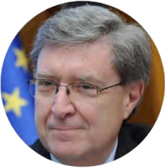
ENRICO GIOVANNINI PRESIDENT