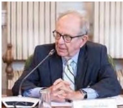
P.C. Padoan, President of Unicredit