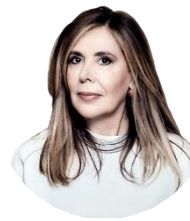
Maria Latella Journalist and writer