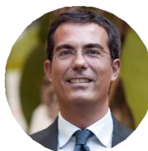
Giovanni Floris Journalist and TV host