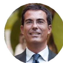
Giovanni Floris Journalist and TV host