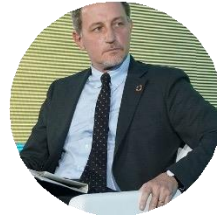
Massimo Giannini Writer and journalist