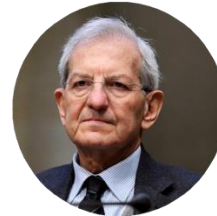
Luciano Violante President of Fondazione Leonardo – Civiltà delle Macchine