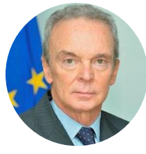
Ferdinando Nelli Feroci Presidente of IAI