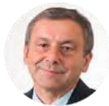
Francesco Profumo President of Quadrivio Group and of IsyBank