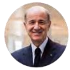
Corrado Passera Founder and CEO of Illimity