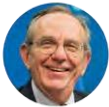
Pietro Carlo Padoan Presidente of UniCredit