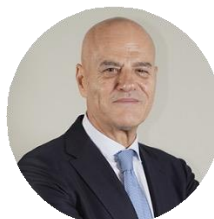
Claudio Descalzi CEO of Eni