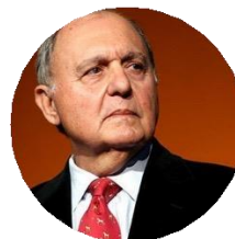
Paolo Savona President of CONSOB