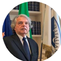
Renato Brunetta President of CNEL