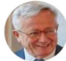
Giulio Tremonti President of Aspen