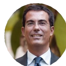
Giovanni Floris Journalist and TV host