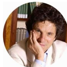
Maurizio VIROLI Professor Emeritus of Politics, Princeton University