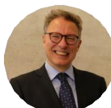
Luciano Floridi Professor and Founding Director of the Digital Ethics Center in Yale